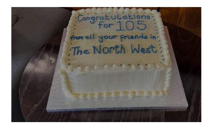
A large birthday cake