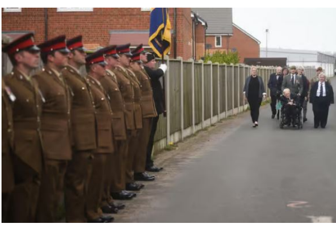
R.E.M.E.guard of honour – Blackpool Airport